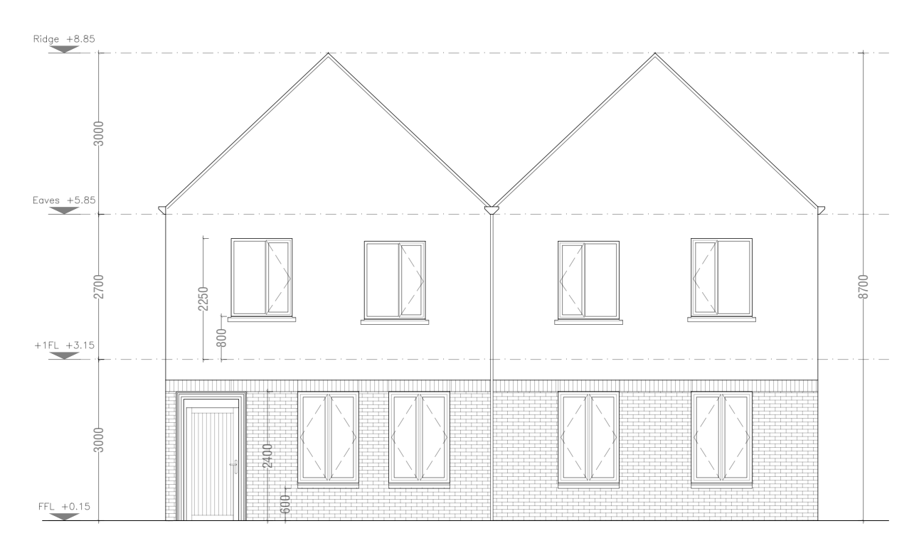
House Type N1 Semi-Detached Front Elevation