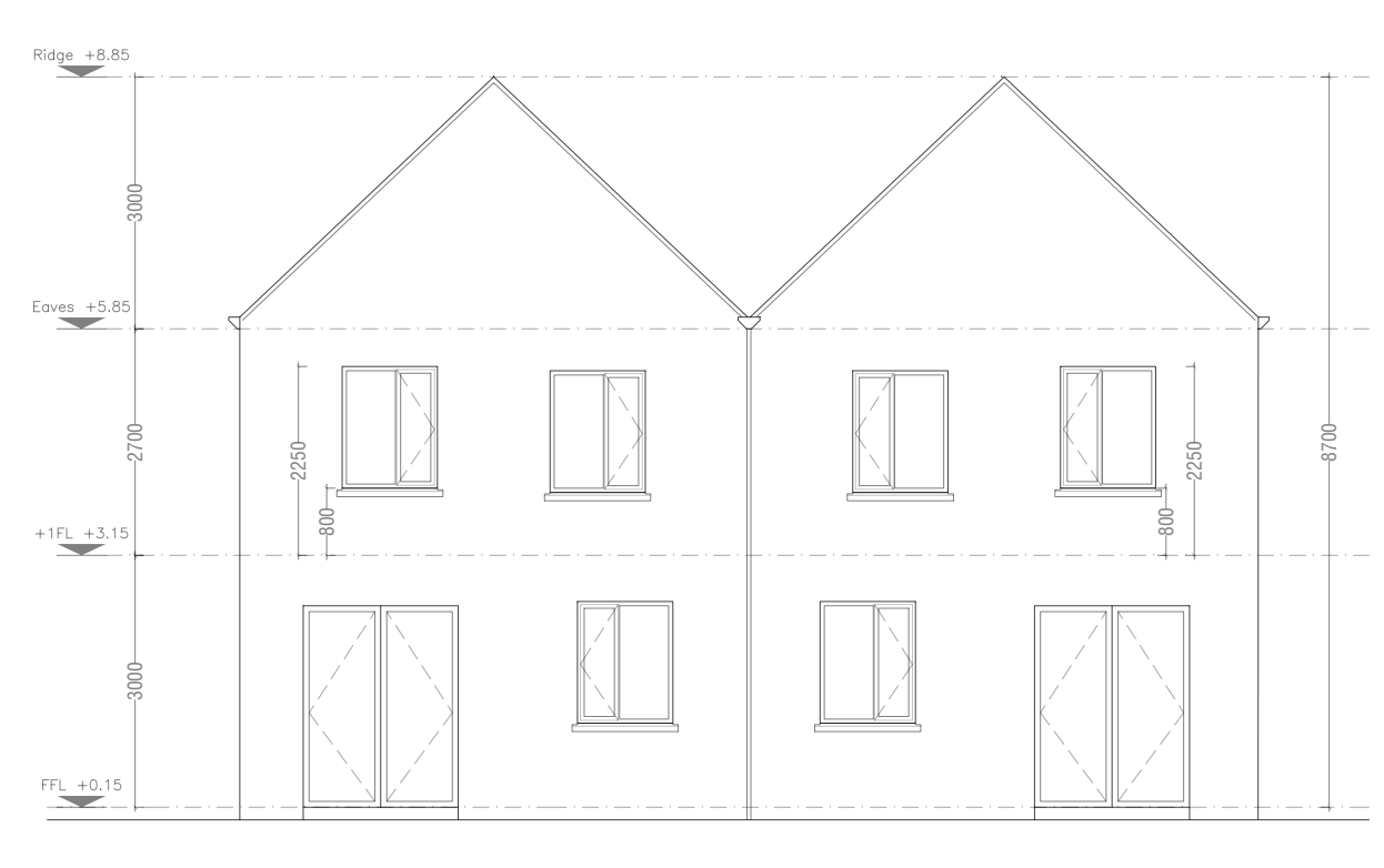
House Type L2 Semi-Detached Rear Elevation